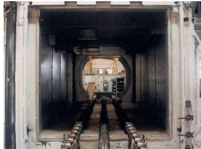
Inside view of an aging oven