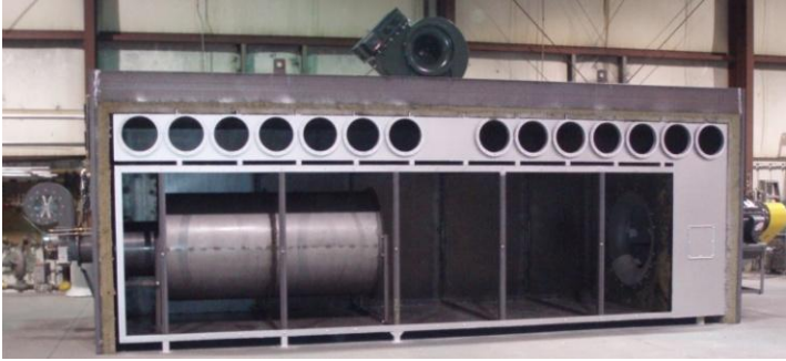
Left: the high-tech heart of a curing oven at Stelter & Brinck's facility prior to shipment.

Our specialty ovens and furnaces are ideally suited for higher temperature operations or in environments that require extra heavy-duty construction, easy to use and install and are designed to GE GAP (IRI) or NFPA construction standard.