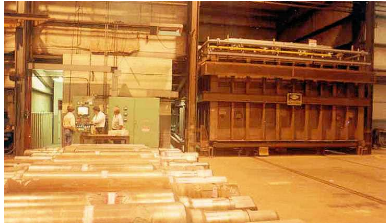
Electric to gas conversion of tilt-style heat treat furnace