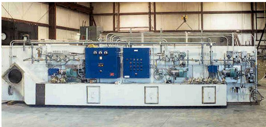
Side view of an aging oven