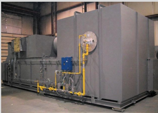
Stelter & Brinck's Thermal Oxidizer, built for Veyance Technologies

“I would recommend S&B; they make my life easier! It’s as simple as that!”