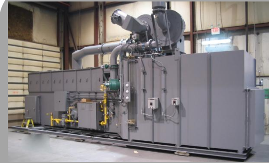
A Stelter & Brinck oxidizer installed at Western Digital

Sheely says, "Our 24/7 manufacturing operation requires robust equipment. S&B has redesigned our equipment to meet those standards." He goes on to say, "We are now able to keep our equipment up and running 24/7. Due to S&B's upgrades, our equipment is very reliable."